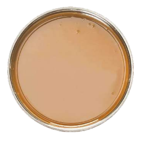
Pure 100% hazelnut paste