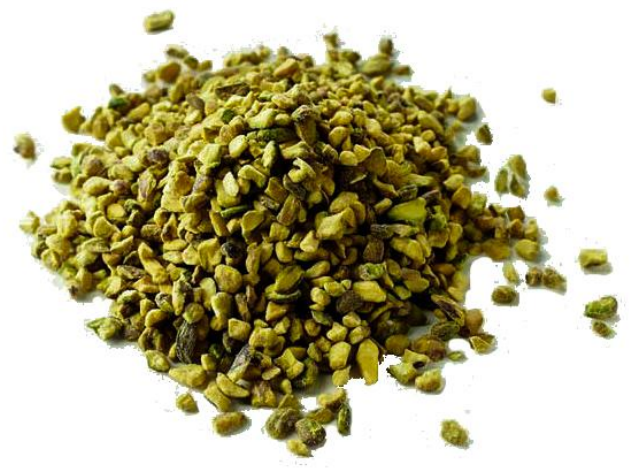
Diced pistachios kernels 3-5 mm, 5-7 mm