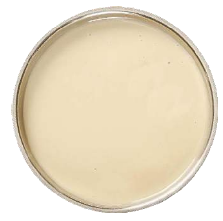
Pure 100% Blanched almond paste