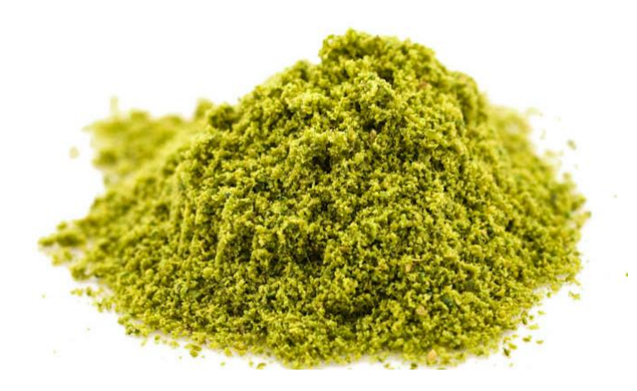
Natural pistachios kernels flour