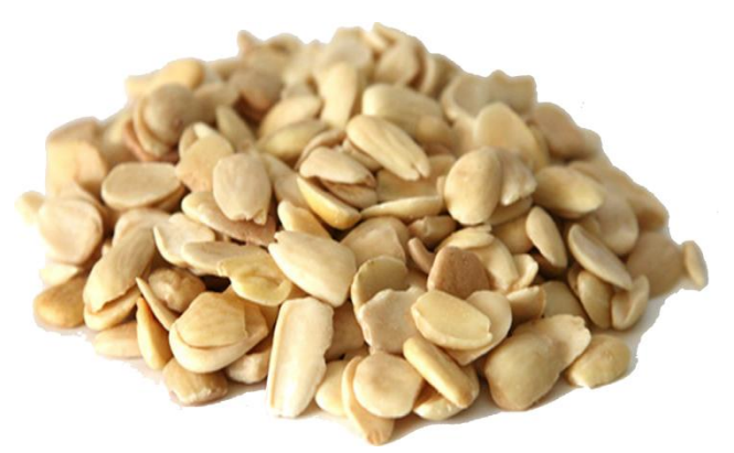
Blanched whole & splits almonds