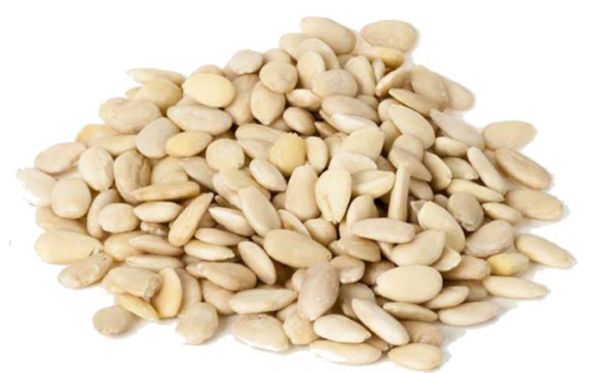
Blanched whole almonds 16/18-27/30