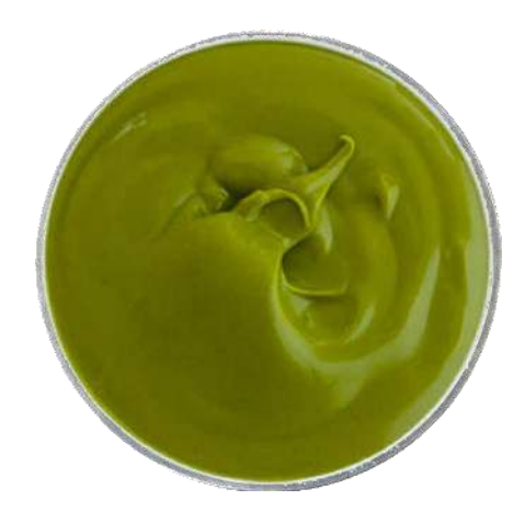
Pure 100% pistachio paste